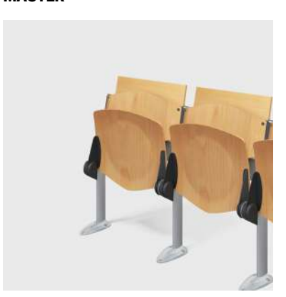
Structure with legs on both sides of position