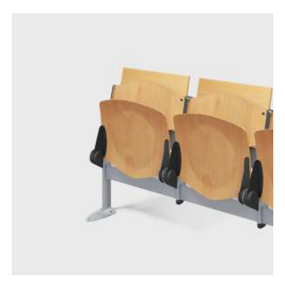
Structure on beam with floor legs at every 3 positions