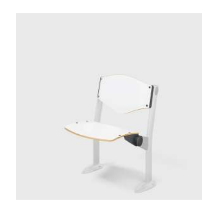
Seat and backrest faced with laminate