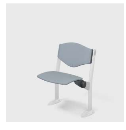
Upholstered seat and backrest