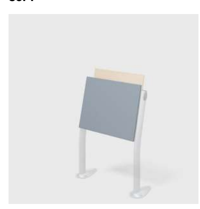
Upholstered front panel