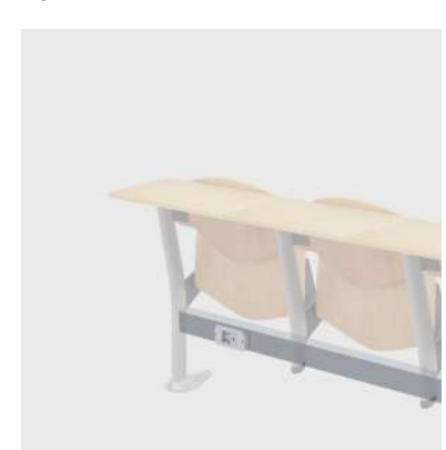
Wire management beam with 1 track for electrical/data sockets. The track allows connection to be made between boxes and from the floor.