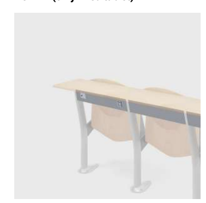
Wire management channel with 1 track for electrical/data sockets. The track allows connection to be made between boxes and from the floor.