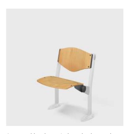
Seat and backrest in beech plywood