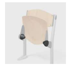
Seat with silent fold