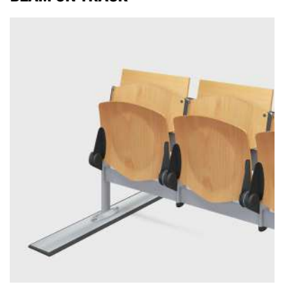
Structure on beam with legs on mobile rail at every 3 positions