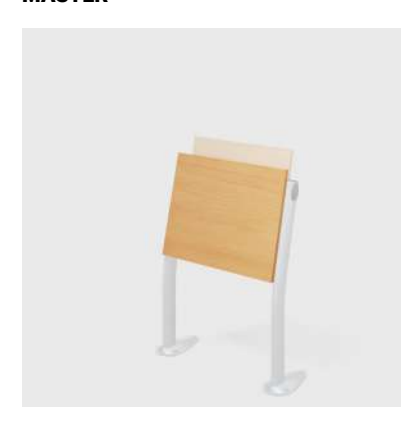
Laminate faced front panel