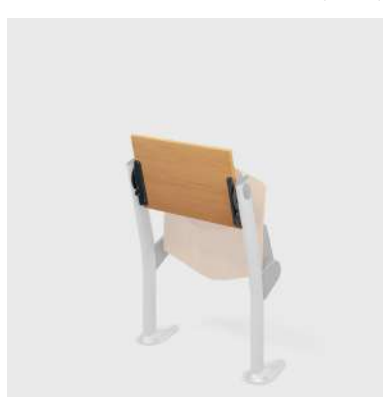
Anti-panic writing tablet