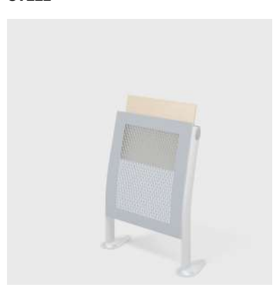
Front panel in powder-coated metal