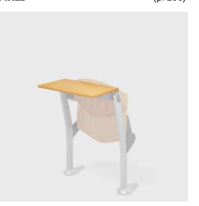
Fixed writing tablet