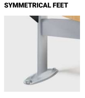
Symmetrical feet with 2 fixing points