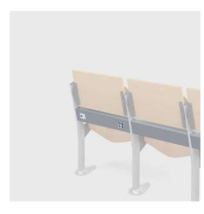
Wire management channel with 1 track for electrical/data sockets or 2 for multimedia. The track allows connection to be made between boxes and from the floor.